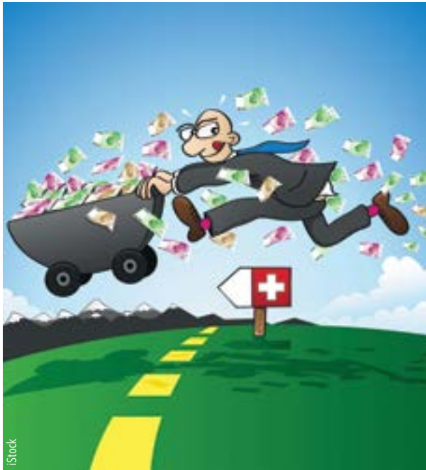
▶ SWISS BANKS: No longer a safe haven.

“The new treaty will also modernise the bilateral taxpayer information sharing arrangements and permit, for the first time, the exchange of