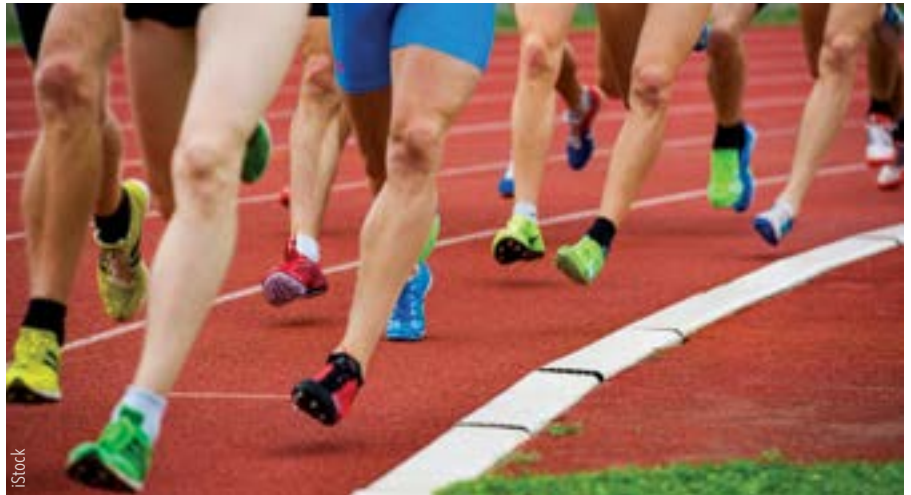
▶ WINNING THE RACE: Athlete support staff subject to sanctions.

Australian legislation has now aligned with the World Anti-Doping Code (WADC), ensuring athletes are treated under the same rules everywhere, regardless of nationality or sport.